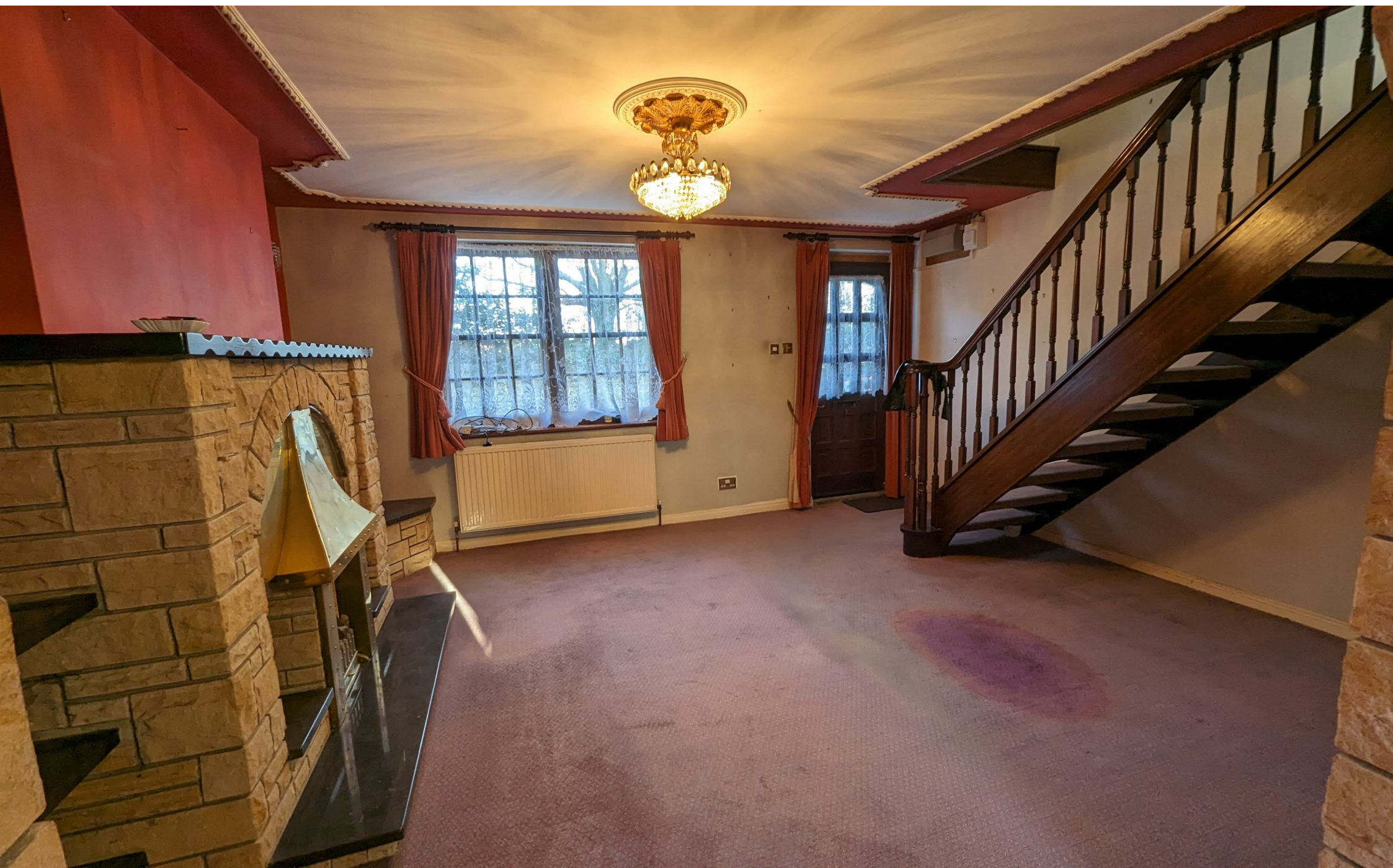
The Orlands | Newton Aycliffe £115,000